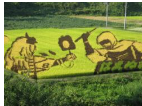
(Last Year's Tanbo Art)

Application: Yonezawa City Tourism Division TEL 22-5111